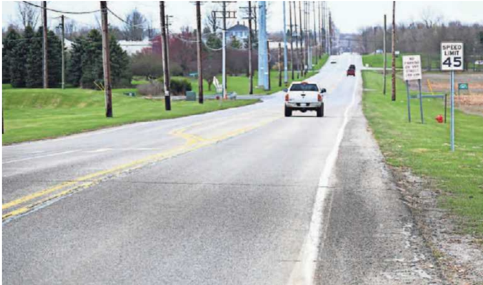
Micro-sealing will take place on this section of Michigan Avenue and seven other streets this summer to extend the life of the road for an additional seven to ten years.

April 16, 2025, The Daily Reporter , p. A3